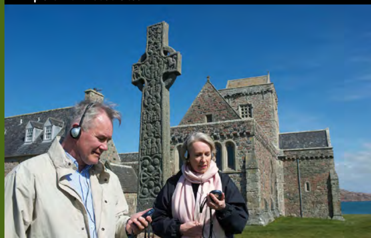
Explore with the audio tour