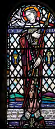
St Columba, founder of the abbey