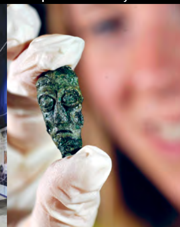
Get up close with history